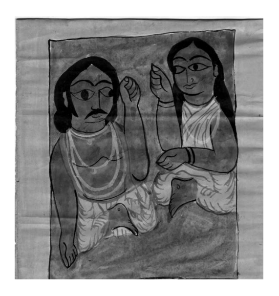
A detail from a scroll made by a Jadu patua showing the Santal deities of the Creation myth: Maran Buru and his wife Jaher Era.