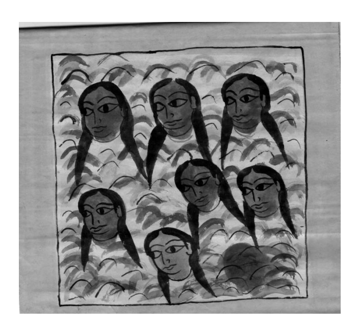
Another image of the same scroll shiwing Santal ancestors (Hapram ko)